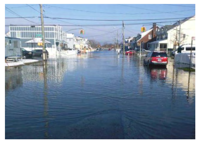
Open space and environment