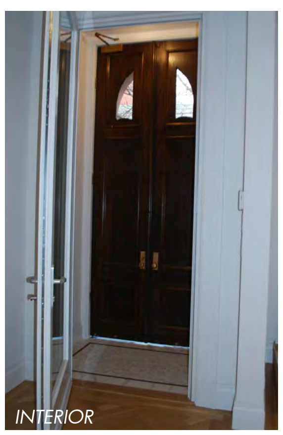
RESTORED ORIGINAL DOORS

ROOF ADDITION AND MECHANICALS NOT VISIBLE FROM THE STREET