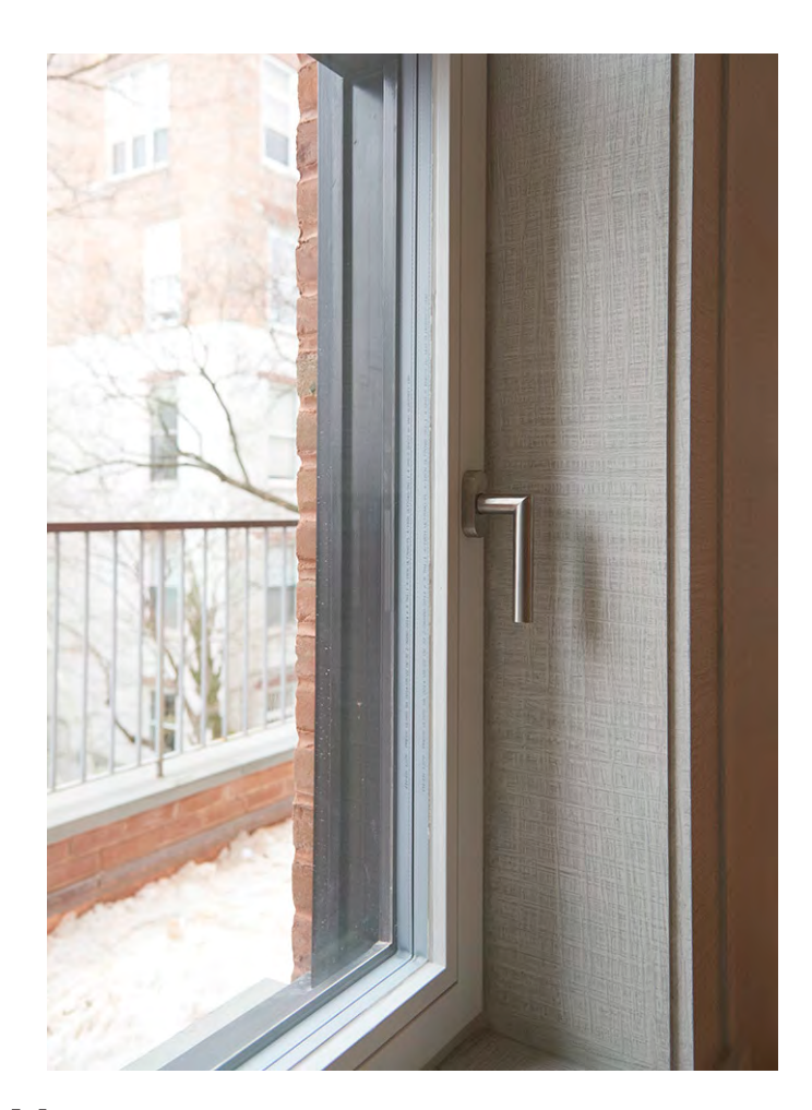
PASSIVE WALL DETAILING ON THE INTERIOR, LEAVING ORIGINAL BROWNSTONE FACADE INTACT.